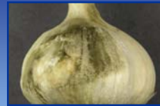
Embellisia skin blotch/canker