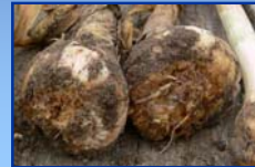
Stem and bulb nematode