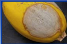
Black rot/Gummy stem blight