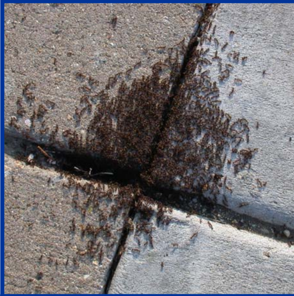
Pavement ants on a sidewalk.

Control: Knowing what species of ant you have, as well as their habits, will help you find the nest and select proper baits or sprays. You will need to kill the queens to eliminate a colony. To find the nest, inspect foundation perimeters for outdoor colonies, and for lines of worker ants that are foraging for food. Track any foraging workers back to the nest.