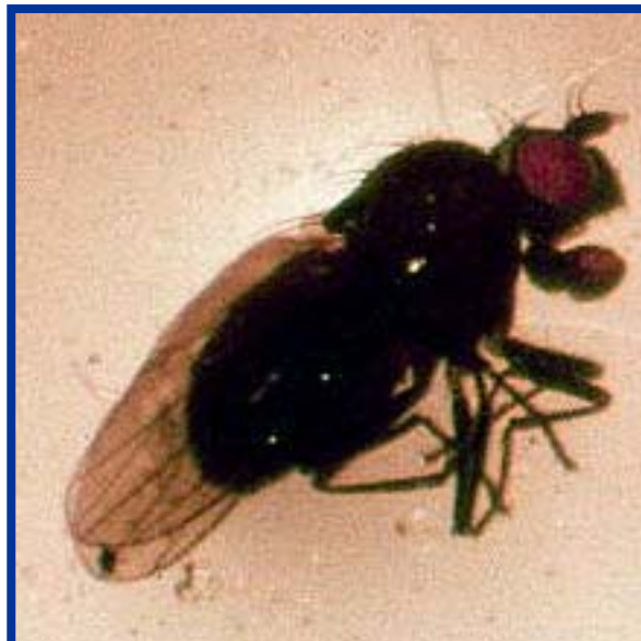
A shore fly.

Appearance: Adult fungus gnats are dark brown or black, delicate flies that are \frac{3}{16} inch long and resemble mosquitoes. The larvae are slender maggots that reach \frac{1}{4} inch when fully grown. The larvae are whitish or translucent with a black head capsule.