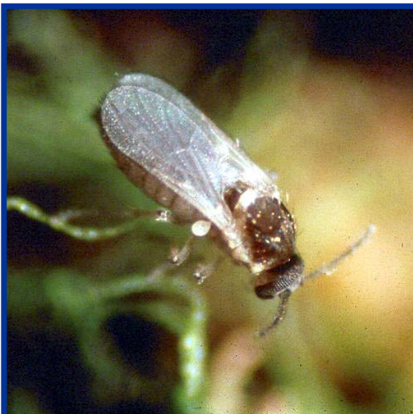
A fungus gnat.

Shore flies ( Scatella stagnalis ) are another nuisance insect that is often confused with fungus gnats in the greenhouse. Unlike fungus gnats, they feed on algae and are a problem in greenhouses with standing water on or beneath the benches.