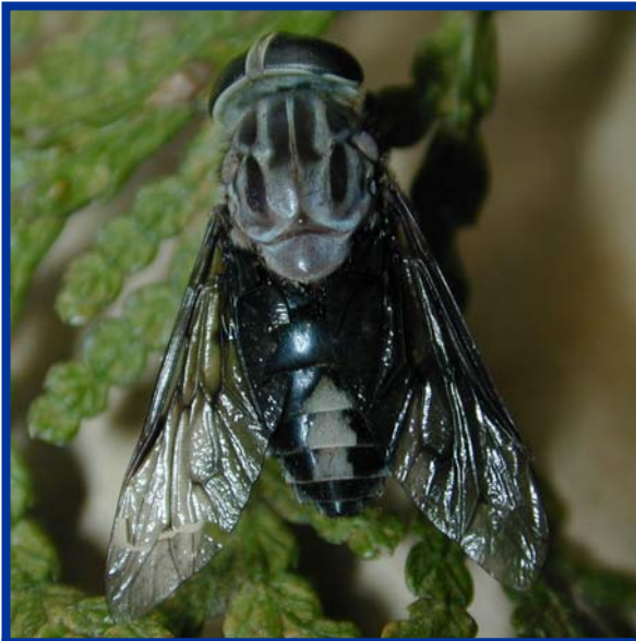
A horse fly.

There are over 30 species of blood feeding deer flies ( Chrysops ) and horse flies ( Tabanus , Hybomitra ) found in Wisconsin. They belong to a family of flies called the Tabanids. Deer flies and horse flies can be active from May until September. The adult females are daytime blood feeders that are most abundant near swamps and marshes, along pond and stream banks, and at the edge of wooded areas. Adults are extremely strong fliers that are attracted to dark moving objects and to carbon dioxide. Tabanids are capable of flying long distances from their breeding sites and adults will rest in tall grass or on leaves, and wait for their preferred hosts (large animal such as livestock, deer, people or dogs) to pass by. Once attracted to a host they will circle around their victim and pursue until they feed or are killed.