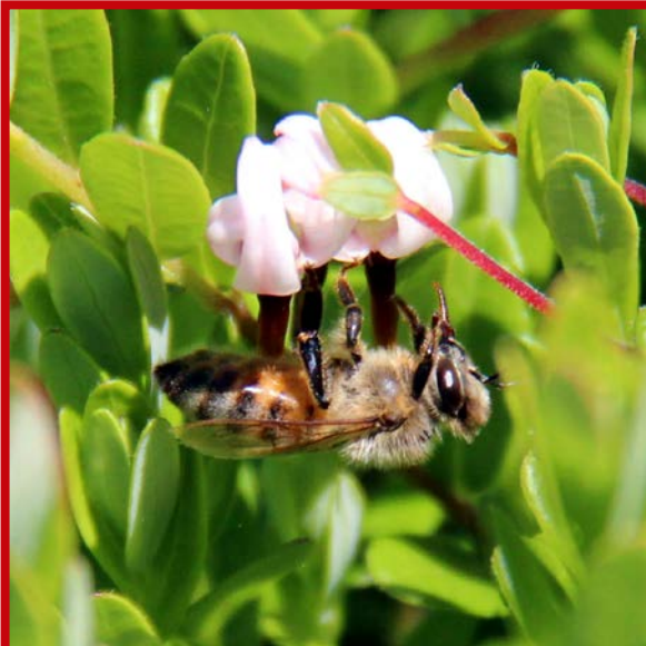
Proper pollination is important for successful cranberry production. (Photo courtesy of Johnston's Cranberry Marsh & Muskoka Lakes Winery, Ontario, Canada).

Successful cranberry production relies on cranberry flowers being adequately pollinated. This fact sheet discusses several strategies that can be used to optimize pollination.