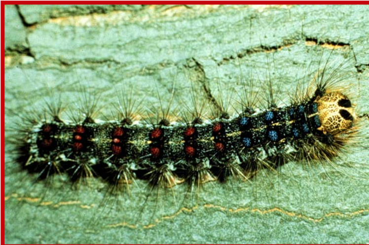
A gypsy moth larva.

The gypsy moth is native to Europe, Asia and North Africa. It was inadvertently introduced into North America in 1869 in a misguided attempt to breed a hardy silkworm. Since that time, the gypsy moth