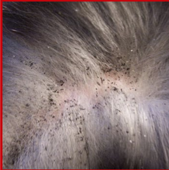
Flea 'dirt' (a combination of dried blood and excrement) indicates a flea problem.

between shoulder blades). Effective topical pet treatments (available over the counter) commonly contain active ingredients such as fipronil, imidacloprid, indoxacarb, permethrin, or selamectin. Effective oral products contain active ingredients such as afoxolaner, fluralaner, lufenuron, nitenpyram, sarolaner, or spinosad. Flea collars contain insect growth regulators such as methoprene or insecticides such as flumethrin, imidacloprid, or tetrachlorvinphos. Ineffective flea treatments include vitamin B1 or yeast supplements, herbal collars and ultrasonic devices.