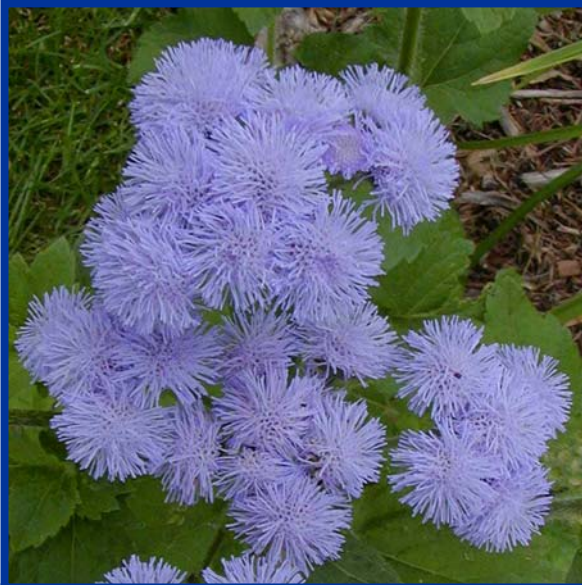
Ageratum plants have soft, fuzzy flowers that can be blue, pink, lavender or white.

What is ageratum? The genus Ageratum includes approximately 60 species of annual and perennial herbs and shrubs in the aster family (Asteraceae) that are all native to Central and South America. One species that is commonly used as a bedding plant, Ageratum houstonianum , is from Mexico, and is named after William Houston (1695-1733), a Scottish physician who collected the first ageratum plants. The name ageratum is derived from the Greek "a geras", meaning non-aging and refers to the long-lasting nature of ageratum flowers.